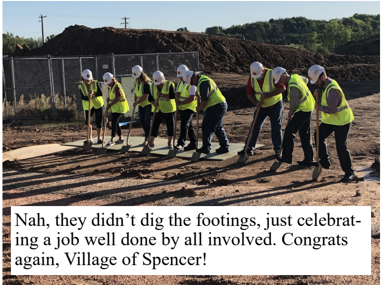
Nah, they didn't dig the footings, just celebrating a job well done by all involved. Congrats again, Village of Spencer!