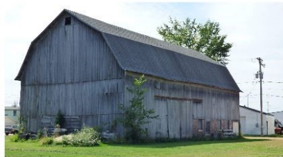
barn view in 2016