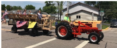
All sales or donations go for Village Street Christmas Decorations.

Bring your camera for a SPOOKTACULAR photo shoot and tour their home.