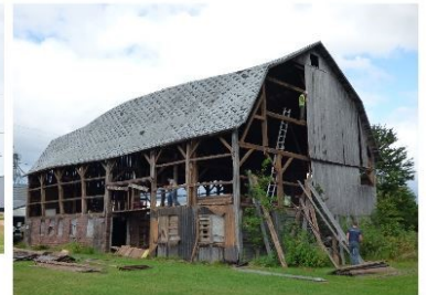
dismantled in 2019

House associated with the barn was built in 1909