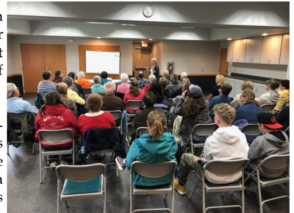
People from Spencer and surrounding communities pack the Village Hall to learn about Human Trafficking in Central Wisconsin

I began to think back when I was a kid and the friends I had, the students I taught as an adult, all the kids I've coached the last 35 years and, of course, my own kids. The world is still the same but there are so many more things in it that seem overwhelming and I'm not even a kid anymore. Let's help our youth and each other, to make things as safe as we can. Seems like it's a lot harder now than it was. Thanks a lot Audrey for helping educate our community. Good stuff!