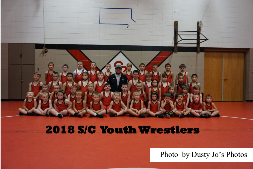
2018 S/C Youth Wrestlers